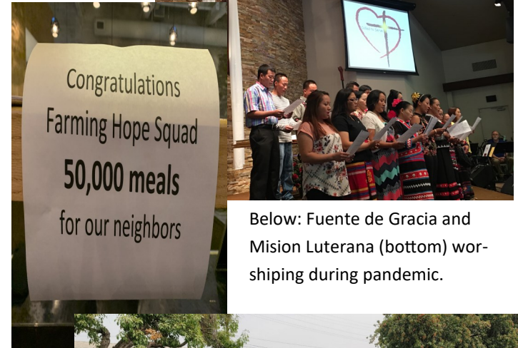
Below: Fuente de Gracia and Mision Luterana (bottom) worshipping during pandemic.